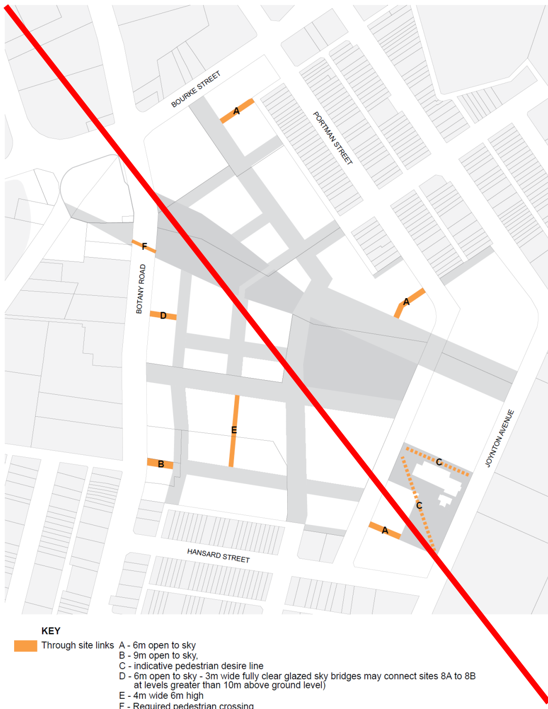
Figure 3.27 Through-site links and arcades (Existing graphic below proposed to be deleted and replaced)